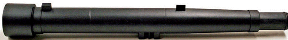
Galileoscope model